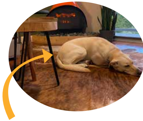
Our dog, Berkeley